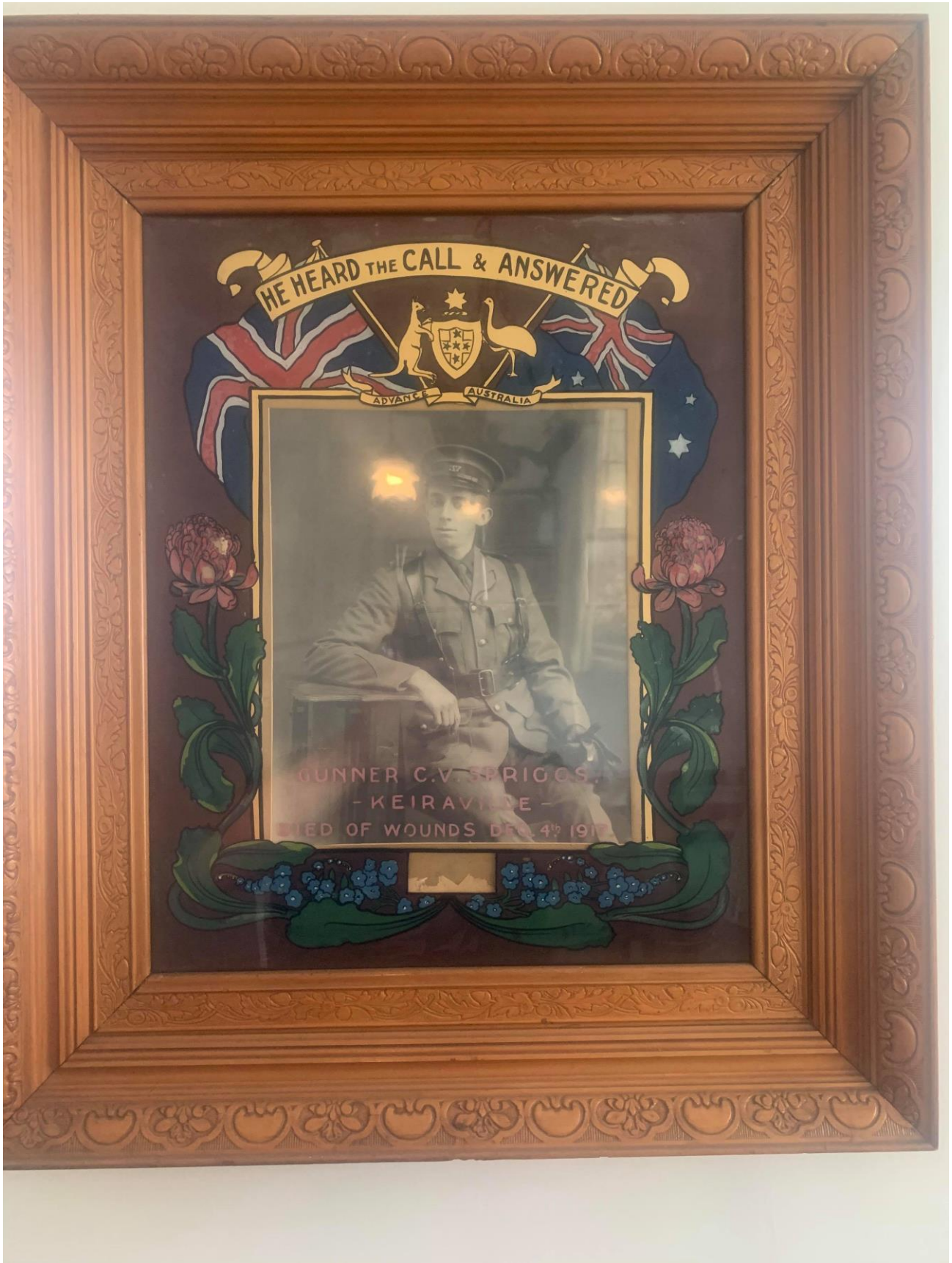
A family photo returned